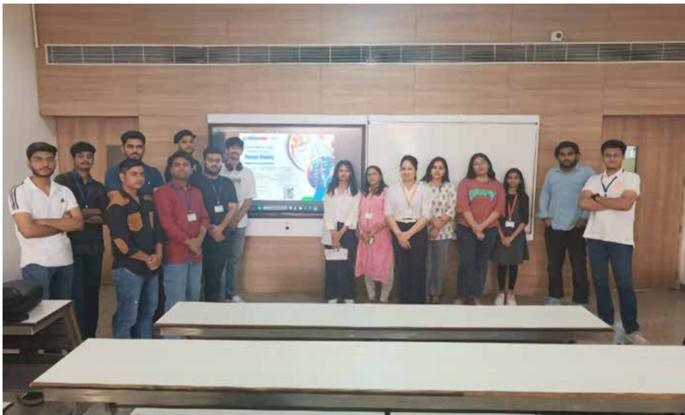
Students Posing for the group photograph after the event