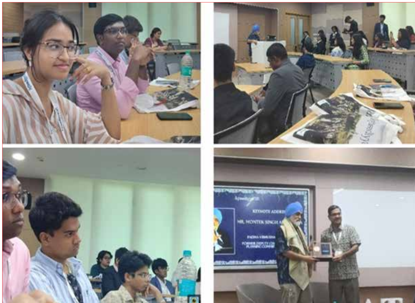
Students Participating in the Iqtisadiyyat 2025, at Shiv Nadar University