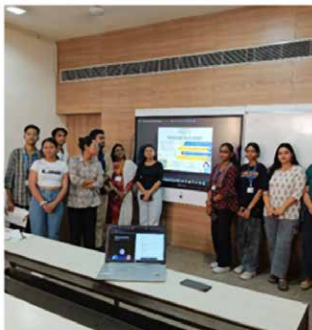
Students participating during the treasure hunt game