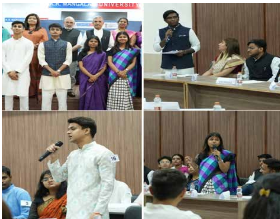
Students Performing at the Youth Parliament