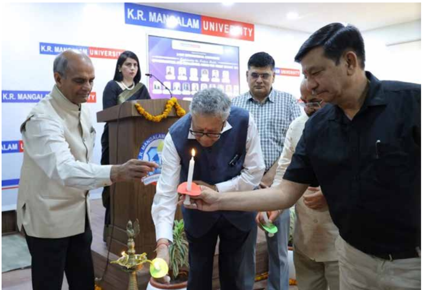
Justice (Dr.) Mukundam Sharma, Former Judge, Supreme Court of India, as Chief Guest during the Lamp Lightening of the Programme

The valedictory session concluded with the felicitation of best paper presenters and highlighted collaborative strategies for achieving Viksit Bharat 2047. Participants praised the event’s intellectual rigour, making it a landmark academic achievement.