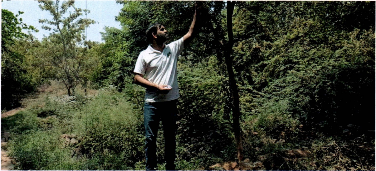
Volunteer of Save Aravali Trust, giving insights on invasive alien species that was colonizing the Aravali Range.