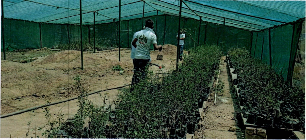
Volunteers of Save Aravali Trust watering extincting plant species