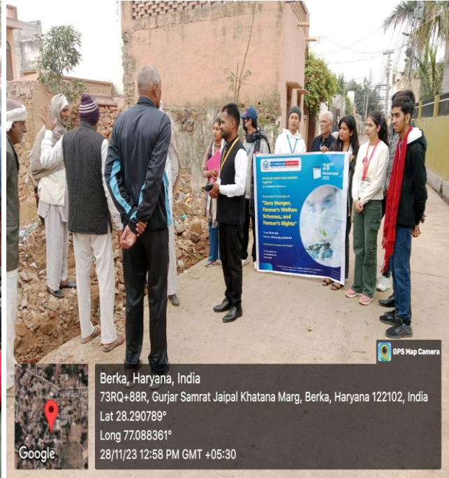
Students of K.R. Mangalam University interacting with local farmers during an awareness campaign