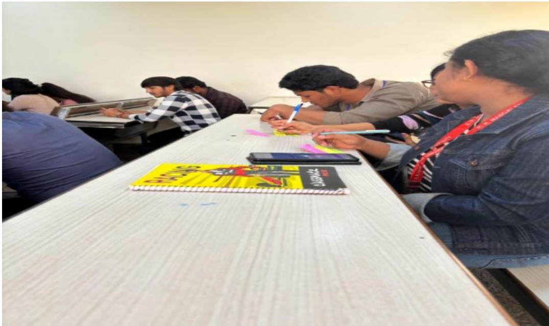
Students showing their vision through their creativity

'The Dream Vision Board' event achieved its goal of igniting creativity and ambition among students. The outcomes, in the form of visually stunning vision boards and the shared sense of purpose, stand as a testament to the event's success in fostering personal growth and encouraging students to pursue their dreams with zeal and determination.