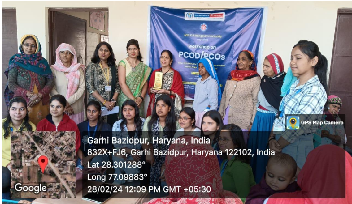
Group photograph of NSS volunteers, coordinators, and village women participants after the successful completion of the workshop on PCOD/PCOS.