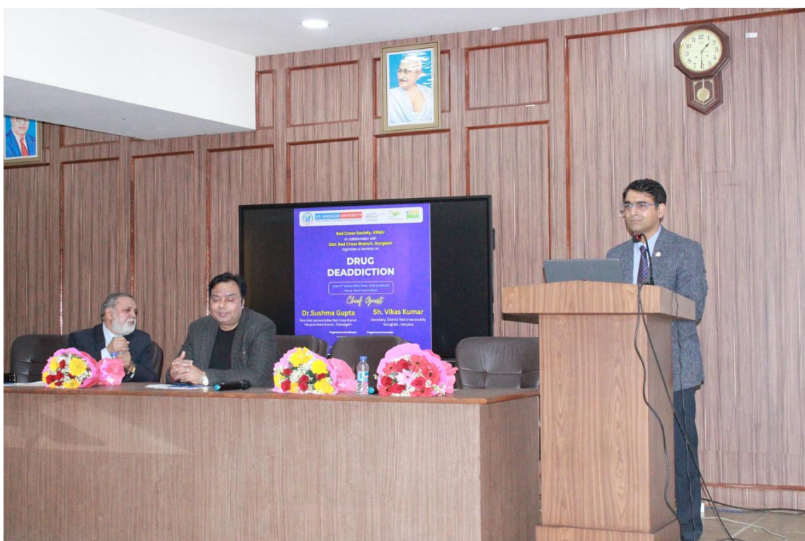
Seminar on Drug De-addiction