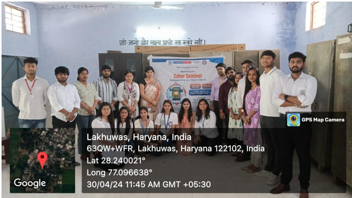
Cyber Sentinel – Digital Safety Workshop