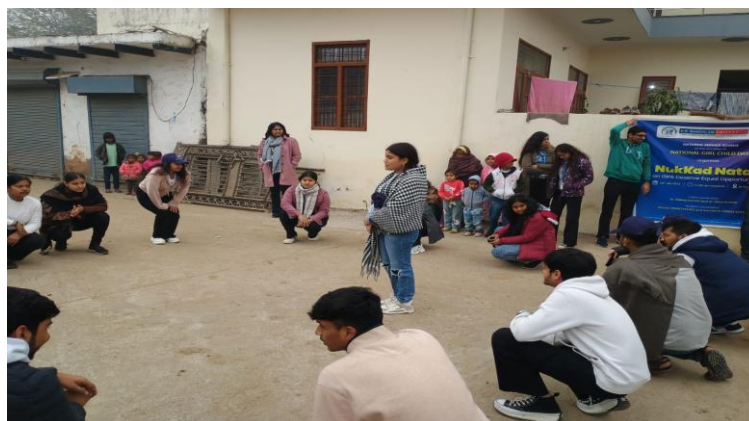
Nukkad Natak on National Girl Child Day