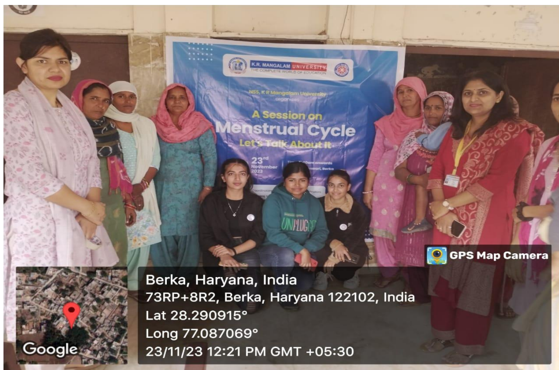
A session on Menstrual Cycle