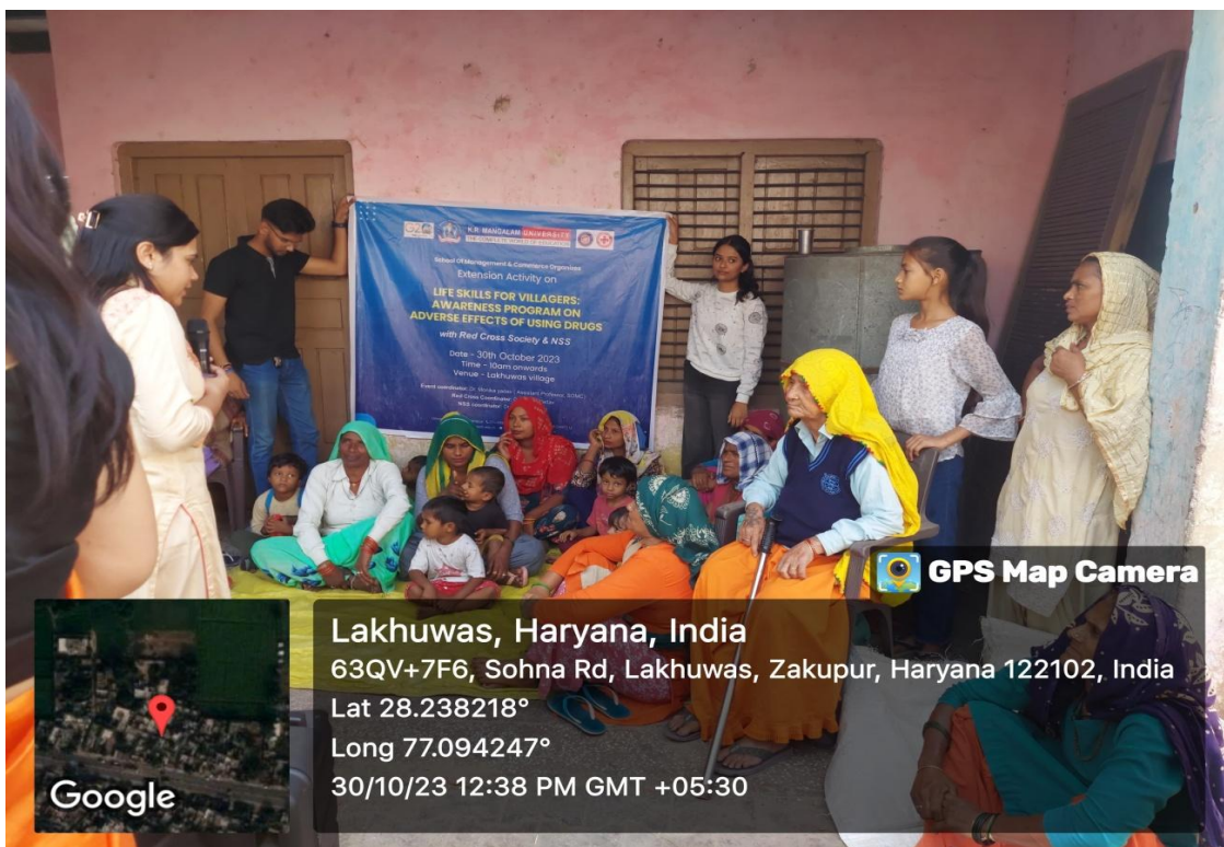
Awareness programme on Drug Addiction – Menace to Youth’s Future