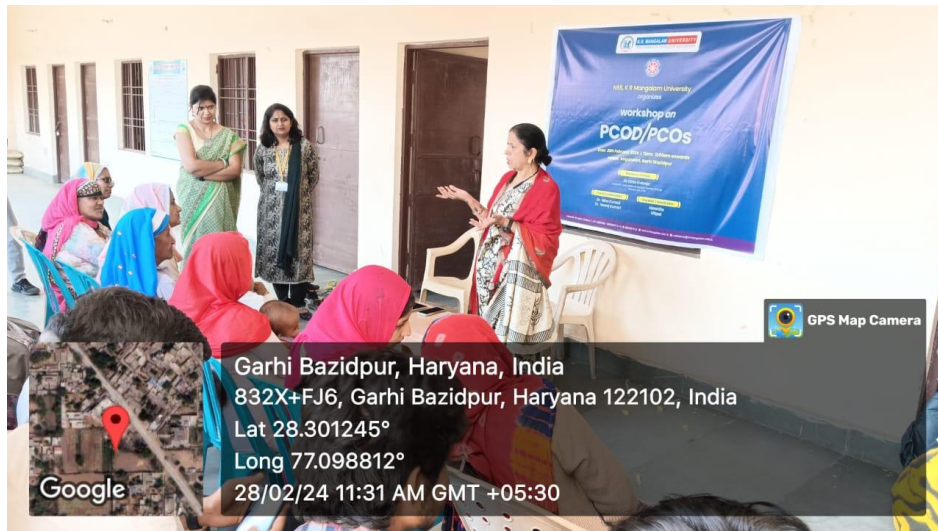
Workshop on PCOD/PCOS