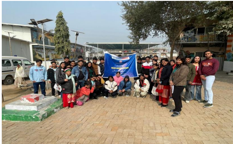
Visit of Old age home