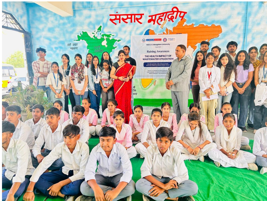
Awareness programme on Health Impact of Wastewater Utilization