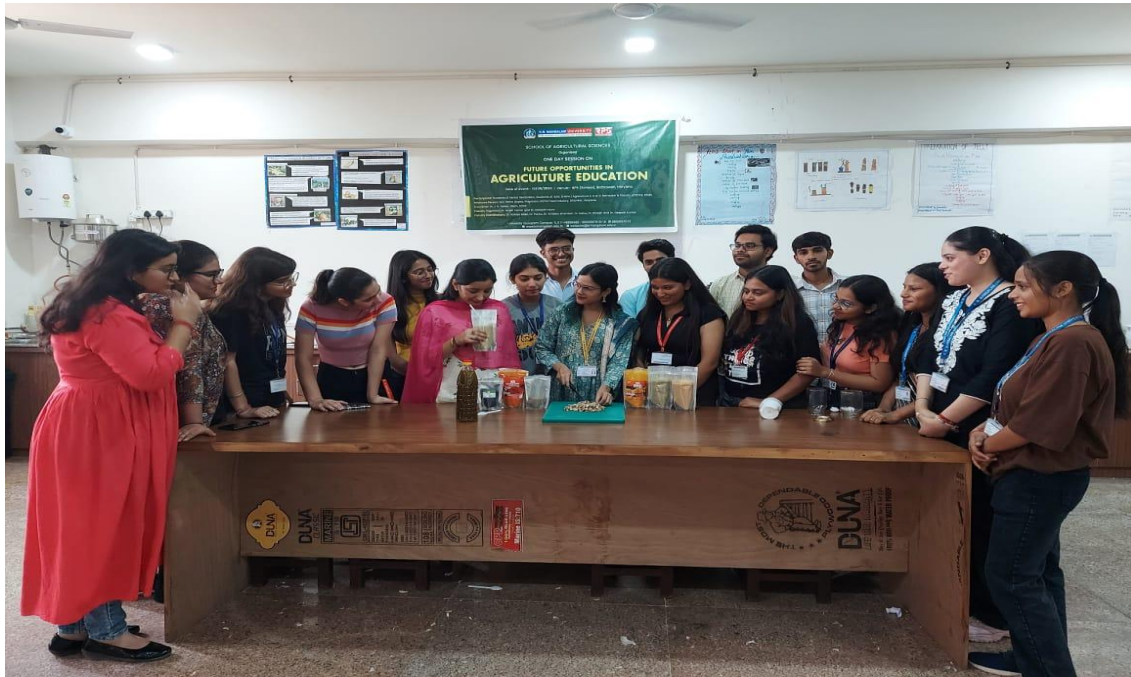
Programme on Future Opportunities in Agriculture Education