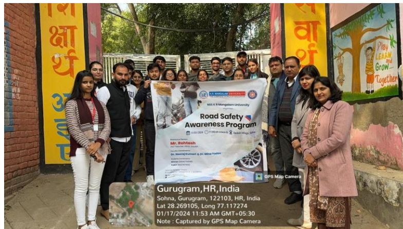
Road Safety Awareness Program