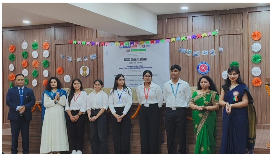
A group photograph of all NSS group leaders