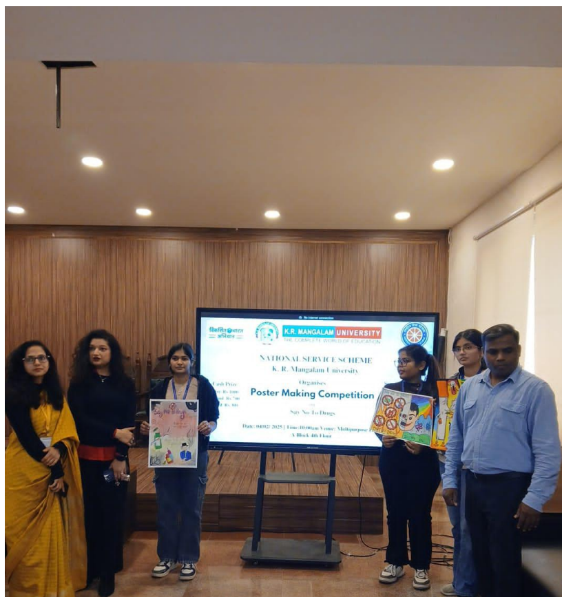
Winner of competition with judge and event coordinators