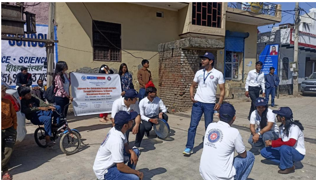
NSS volunteers performing nukkad natak