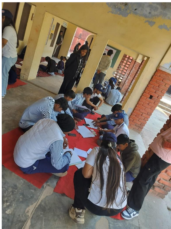
School students preparing their poster on road safety