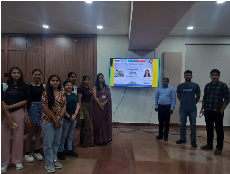
A group photograph of speaker and NSS volunteers