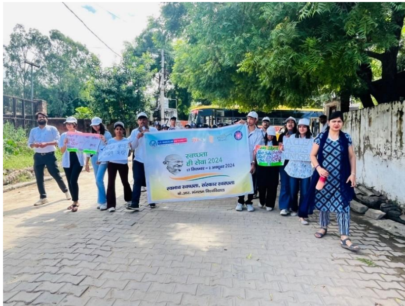
NSS volunteers and coordinator during rally

The rally attracted the attention of villagers, promoting awareness on sustainable cleanliness practices. The event concluded with reflections on the importance of collective action for a cleaner India.