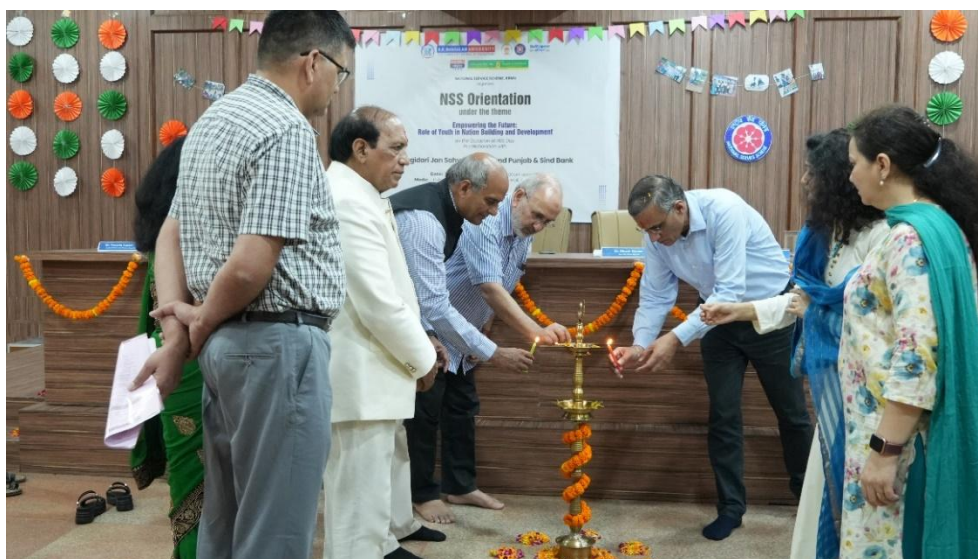
The guest during lamp lightening