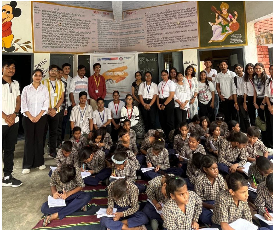
School students during essay writing competition