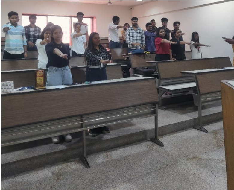
NSS volunteers during pledge ceremony