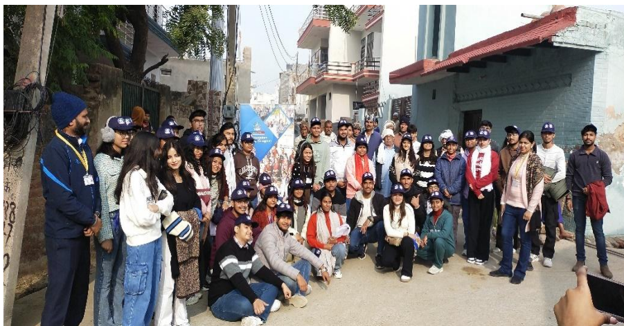
NSS volunteers with villagers after performing nukkad natak on drug abuse