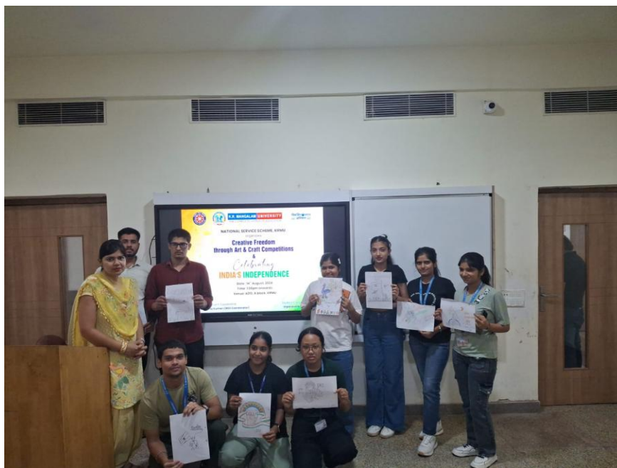
NSS program coordinator with NSS volunteers