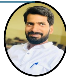
NSS Program Officer (SFU)