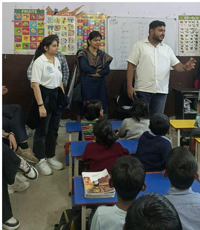
NSS volunteers during teaching