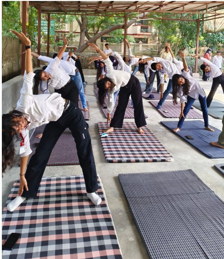
NSS volunteers during their yoga session at Ayush Hospital