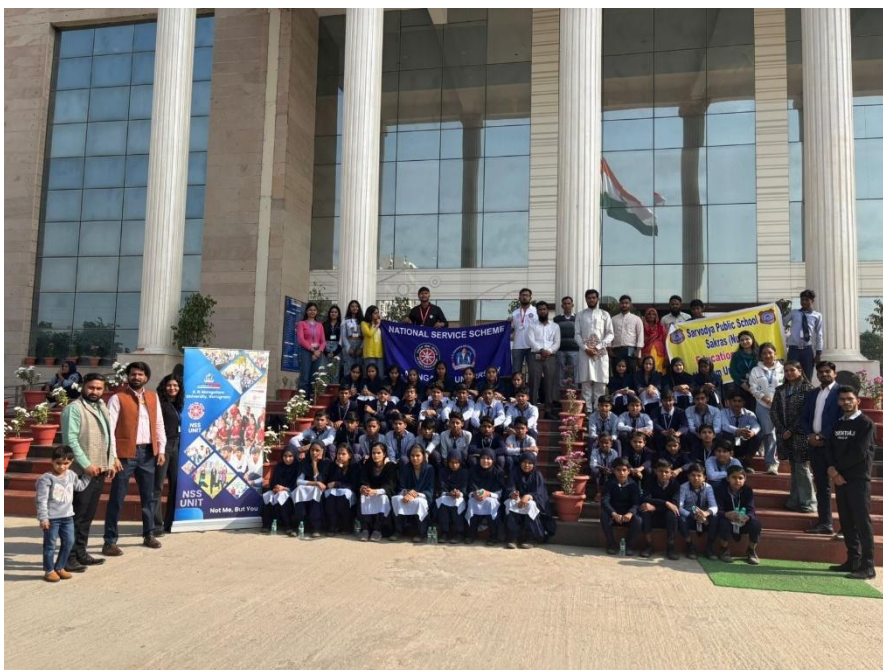
School students at K. R. Mangalam University