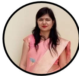
NSS Program Coordinator