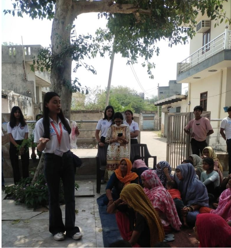
Ms Riya explained about the use of sanitary pad to rural women