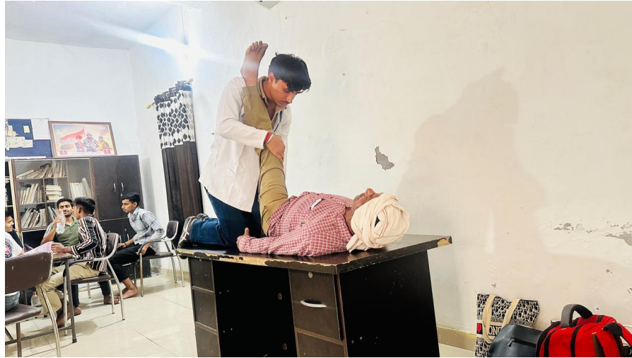
Student from physiotherapy department during the session with villager

commitment to nation-building through service.