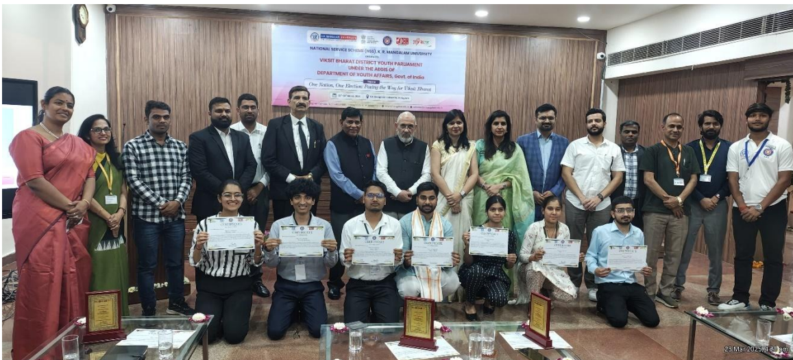
A group photograph with the experts and winners of VBDYP