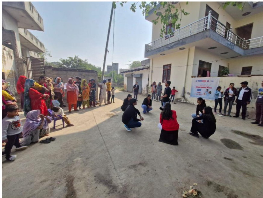
NSS volunteers during their performance of nukkad natak