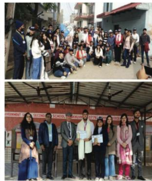
प्रशिक्षण, साक्षर सुरक्षा जागरूकता, नया उन्मुख जागरूकता, और उद्यमिता विकास पर