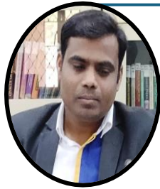
NSS Program Officer (GIA)