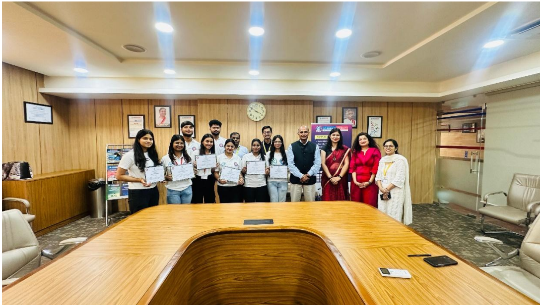
NSS vounteers with Hon'able Vice Chancellor, KRMU