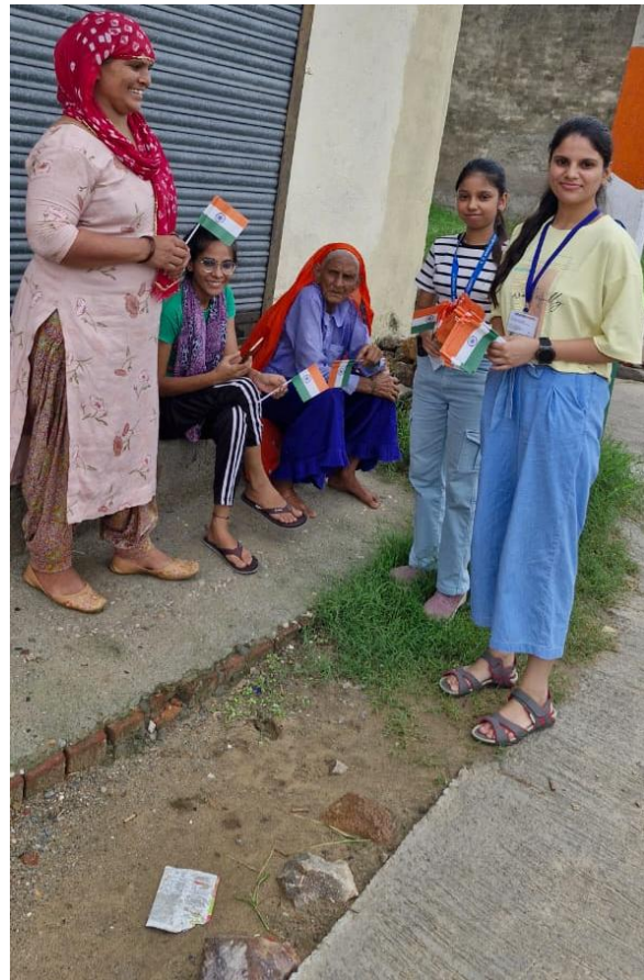
NSS volunteers distributing NSS flags to school students and villagers