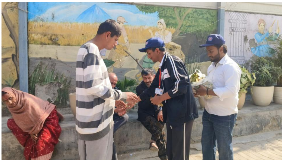
NSS volunteers distributing fruit to the residents of foundation

of the university community and the heartfelt gratitude expressed by the foundation's residents.