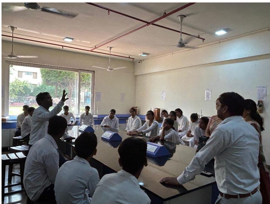
School students exploring physics lab and asking their doubts