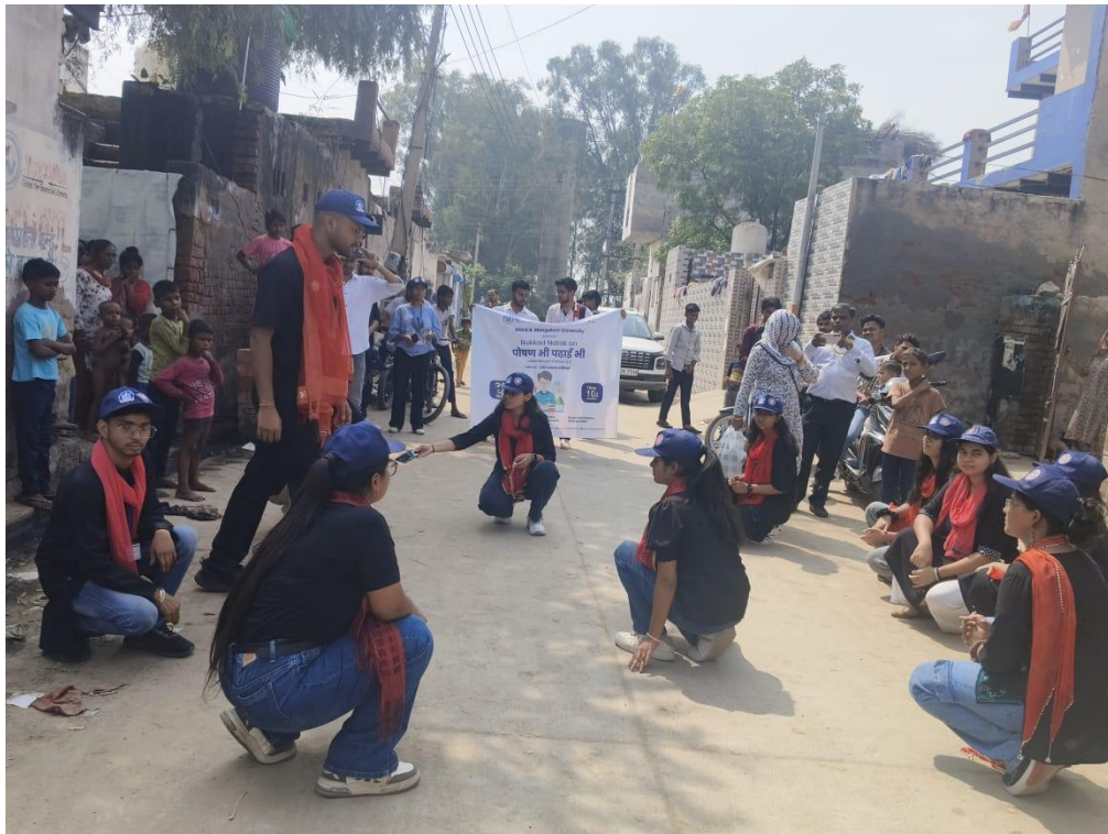
NSS volunteers during their performance