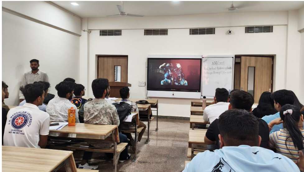
NSS volunteers watching the film

adopt eco-friendly habits. The initiative successfully transformed Earth Day from symbolic observance to active learning. NSS reaffirmed its commitment to continue fostering environmental awareness and action among youth.