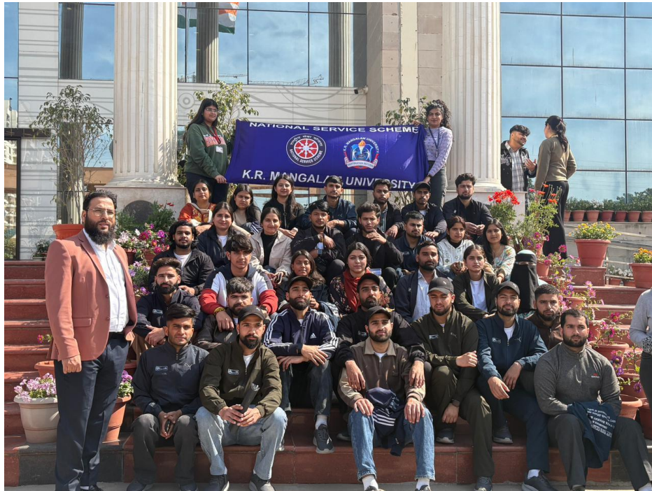
Photo 3: Youth participants of the Inter State Youth Exchange Programme (ISYEP) along with NSS volunteers during a group photograph at K. R. Mangalam University.