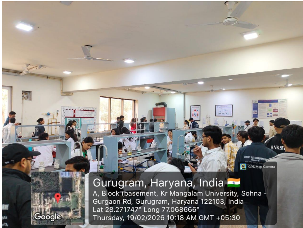
Photo 5: Participants of the ISYEP visit interacting with faculty members during a laboratory demonstration session at K. R. Mangalam University.