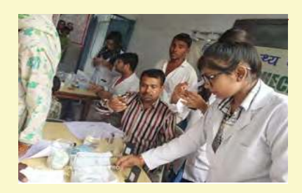
Health Check-up Camp