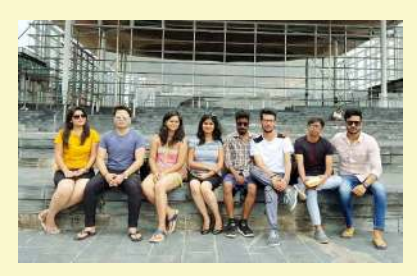
International Visit-Cardiff University