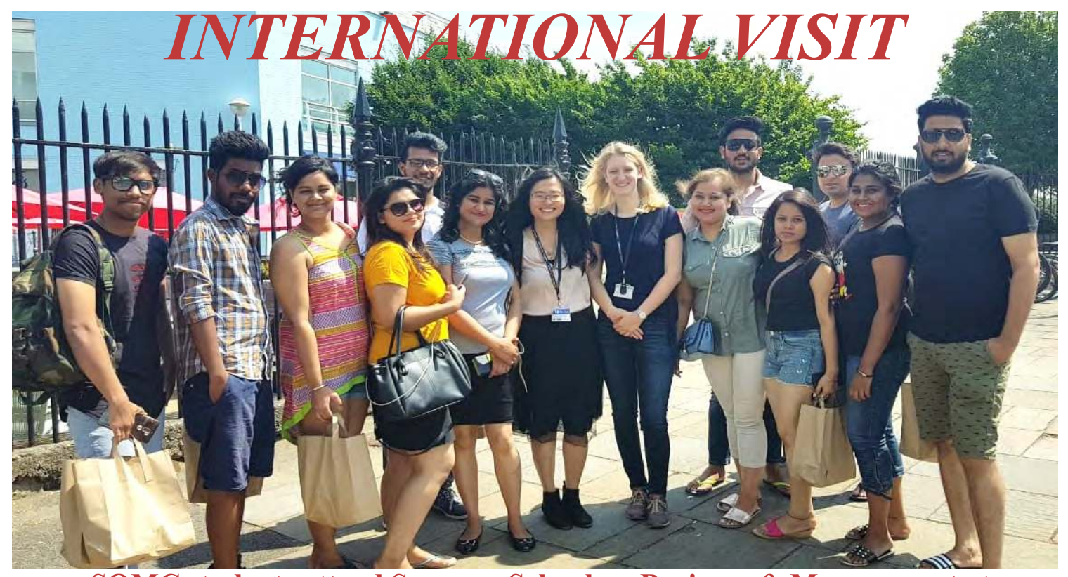
SOMC students attend Summer School on Business & Management at