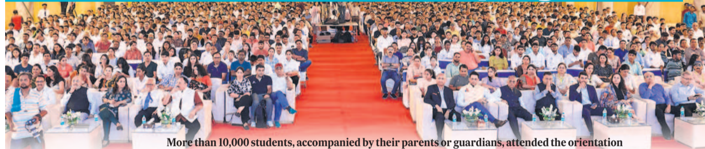
More than 10,000 students, accompanied by their parents or guardians, attended the orientation

K.R. Mangalam University celebrated its freshmen orientation programme, AARAMBH, for the session 2023-24 with great enthusiasm and grandeur. Organised on August 19 to welcome the new entrants with high spirits and zeal, the event was attended by around 10,000 students accompanied by their parents or guardians.