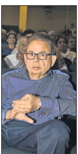
Justice Dalveer Bhandari