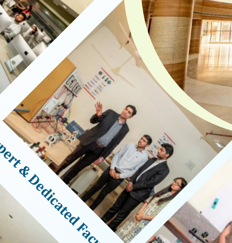
Expert & Dedicated Faculty