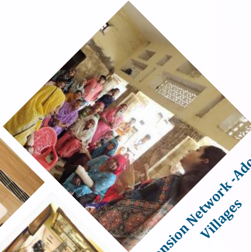
Extension Network - Adopted Villages