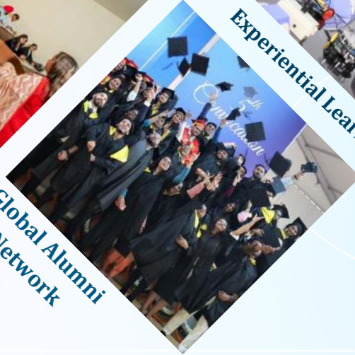
Global Alumni Network