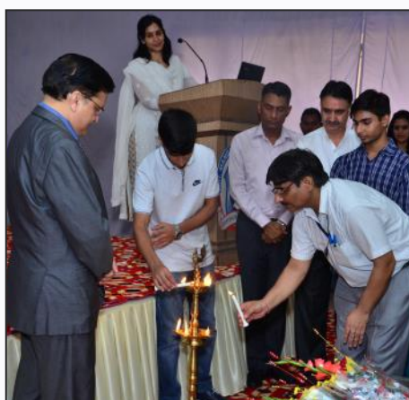
Hon'ble Vice Chancellor lighting the lamp along with the parents.

The Admission and Orientation Program for the first year students of K.R. Mangalam University was held on 22nd August 2015 at the University Campus.