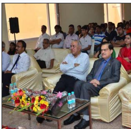
Hon'ble Chancellor & Hon'ble Vice Chancellor along with the parents at the orientation.

“ Think Big & Dream Big ” - Vice Chancellor