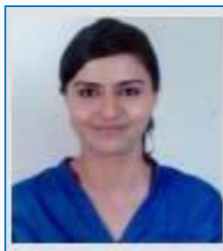
MS. INDU RANI

Paper title: Post-lesion administration of 7-NI attenuated motor and non-motor deficits in 6-ONDA induced bilaterally lesioned female rat model of Parkinson's disease, published in International Journal Neuroscience Letters 2015, 589: pno 191-195.