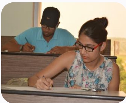
प्रतियोगिता में पोस्टर बनाते बच्चे