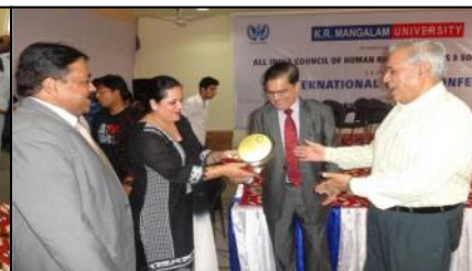
Hon'ble Chancellor and Vice Chancellor felicitating the guests at the occasion.

International Youth Day was celebrated on 12th August, 2015 at K.R. Mangalam University, to highlight the need for educating and involving youth in the building and designing of their future. This year's theme of International Youth Day was Youth and Civic Engagement . The event began with floral welcome of the dignitaries, followed by the ceremonial lamp lightening