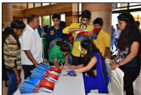
Parents and students at the registration desk being helped by the faculty