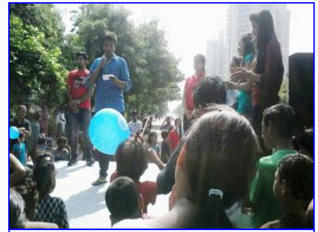
Law students presenting skit on Domestic Violence.

School of Law & the District Legal Services Authority, Gurgaon organized a Legal Awareness Programme on 26 th July at Raahgiri, Galleria Market, Gurgaon. The students of School of Law, K.R. Mangalam University along with Advocates of the District Court, Gurgaon, participated in the programme. They presented a skit