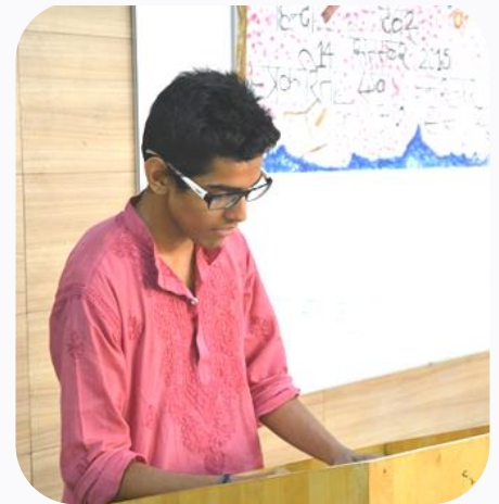
कविता लेखन एवं पाठ में भाग लेते बच्चे