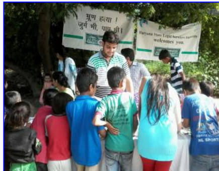
Law students distributing pamphlets at the camp.

School of Law & the District Legal Services Authority, Gurgaon organized a Legal Awareness Programme on 26 th July at Raahgiri, Galleria Market, Gurgaon. The students of School of Law, K.R. Mangalam University along with Advocates of the District Court, Gurgaon, participated in the programme. They presented a skit