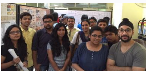
SOAP students along with the faculty at the exhibition.