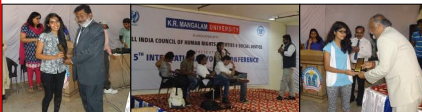
(Pic 1 & 3) Students receiving memento from guests for academic performance. (Pic 2) Students performing a play on youth day.

The event was followed by the scintillating performances of the students which left the audience spellbound. On this occasion,