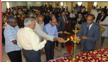
Hon'ble Chancellor and Vice Chancellor along with the dignitaries lighting the ceremonial lamp.