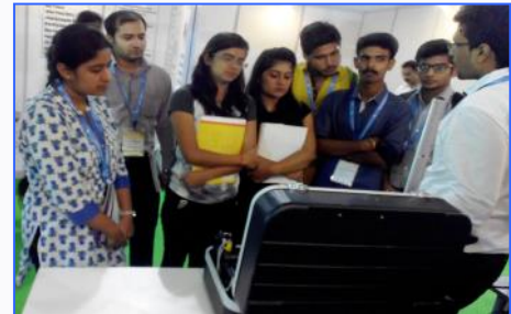
Students looking at the exhibitor's presentation.

The students were enthusiastic and curious to know latest trends in the field of Laser & Photonics, Embedded System Design, Scalable Pro-