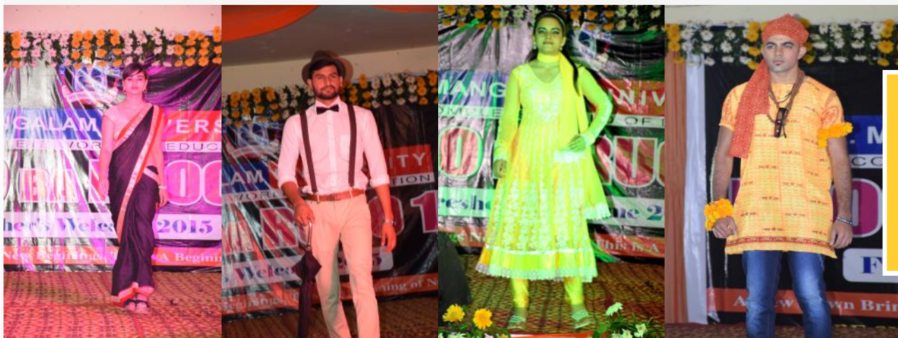
Glimpse s of Fashion Show by KRMU students