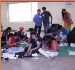
SCIENCE FAIR 2016