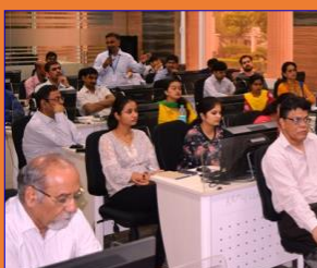
FDP BY SAKSHAM GROUP