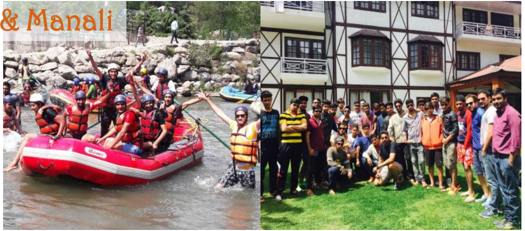
Civil Engineering students enjoying during their trip to Kullu and Manali.