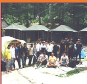
TOURS & VISITS