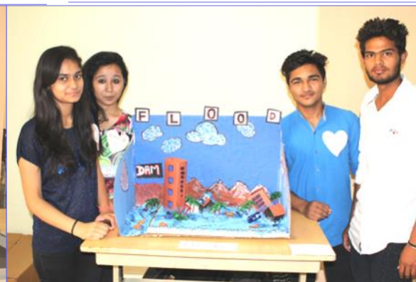
A glimpse of the models exhibited at Science Fair.