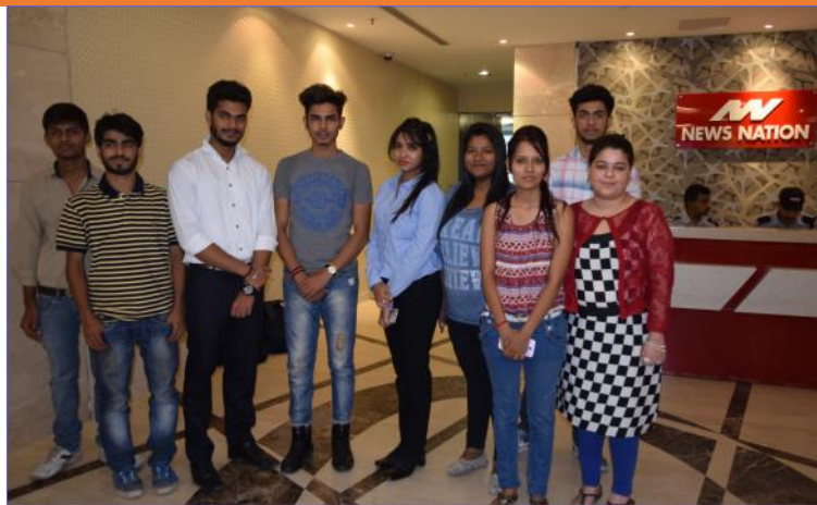
Students of SJMC at the studio of News Nation channel.