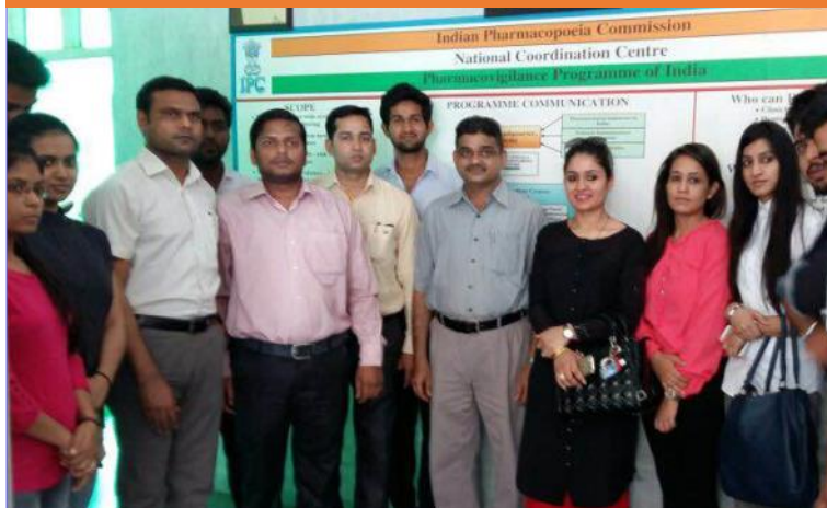
Faculty and students of SMAS along with the officials of IPC during the visit.

School of Medical and Allied Sciences organized a visit to Indian Pharmacopoeia Commission (IPC) Ghaziabad on 22 nd April, 2016 for the students of IV and VI semester, B. Pharm. Indian Pharmacopoeia Commission (IPC) is an Autonomous Institution of the Ministry of Health and Family Welfare, Govt. of India. IPC is created to set standards of drugs in the country. Its basic function is to update regularly the standards of drugs commonly required for treatment of diseases prevailing in this region.