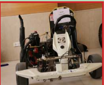
Exhibition of the projects by SOET students-centre spread