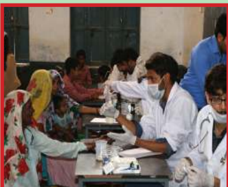
Health Awareness Camps by Health Society, KRMU-pg 7