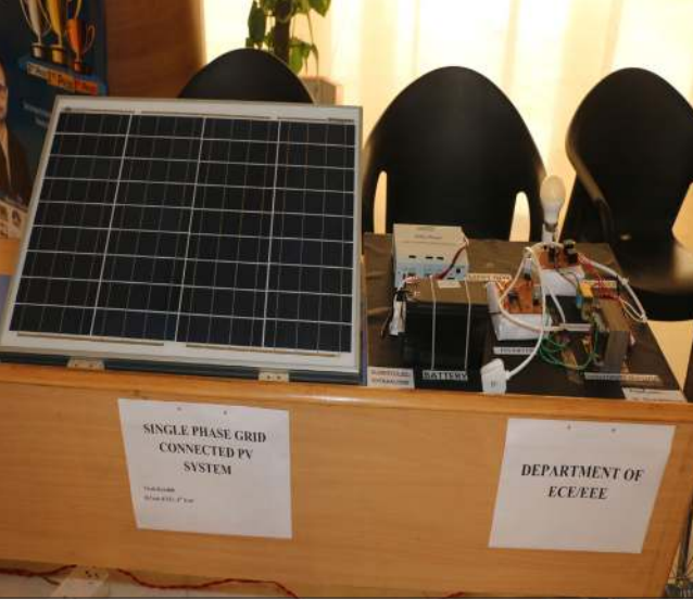
Single Phase Grid Connected PV System