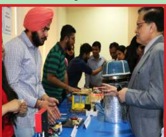
Abdul Kalam Science Society organises Science Fair 2017-pg15