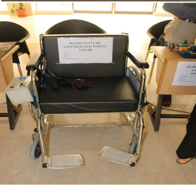
Hand Gesture Controlled Wheel Chair