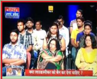
Visit to News Nation Channel and Participation in India Bole Program-pg 4