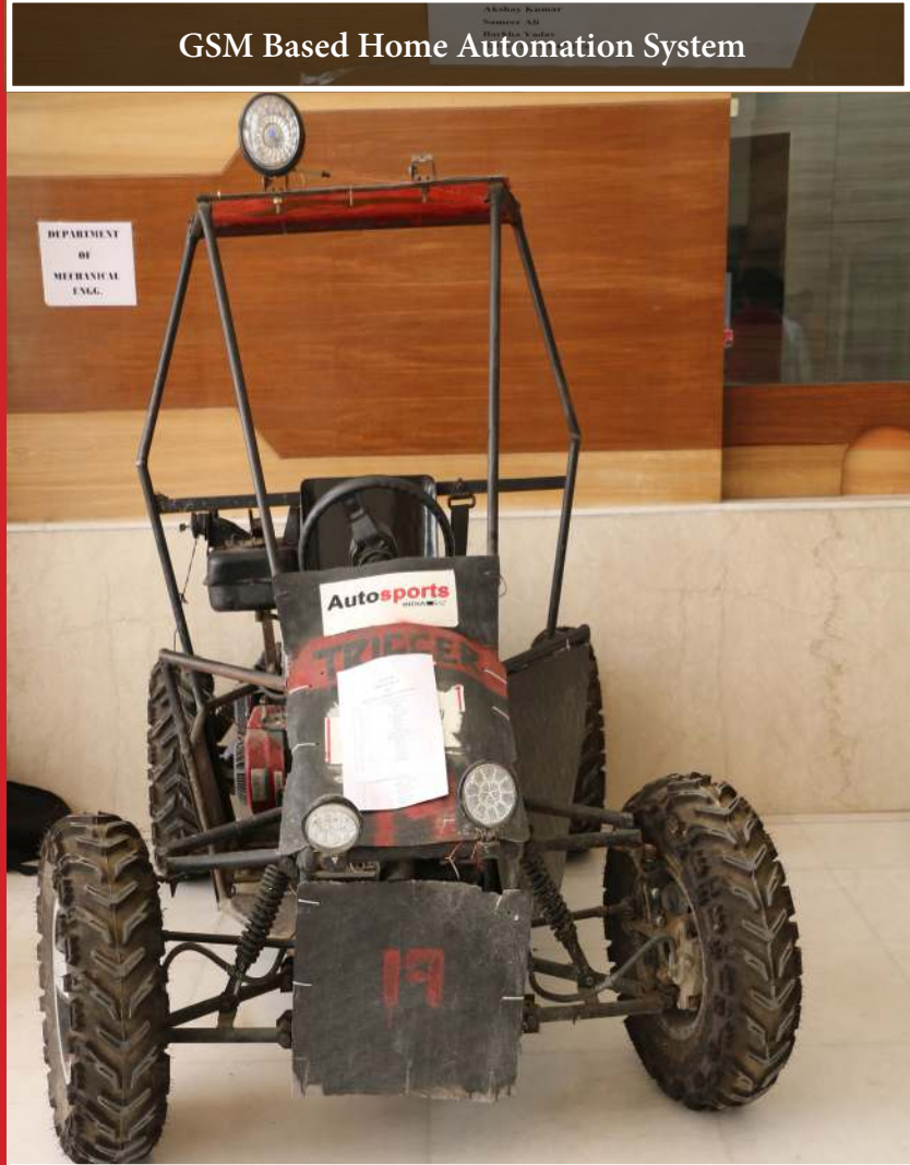
AT- All Terrain Vehicle