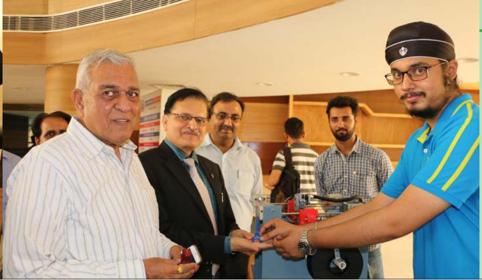
Student presenting output of 3D printer to Chancellor and Vice Chancellor