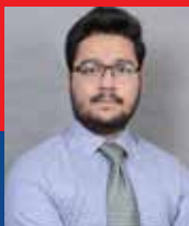
The Bim Engineers