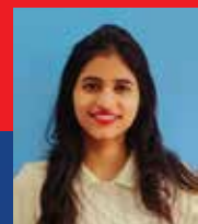
Studio Blue Hill