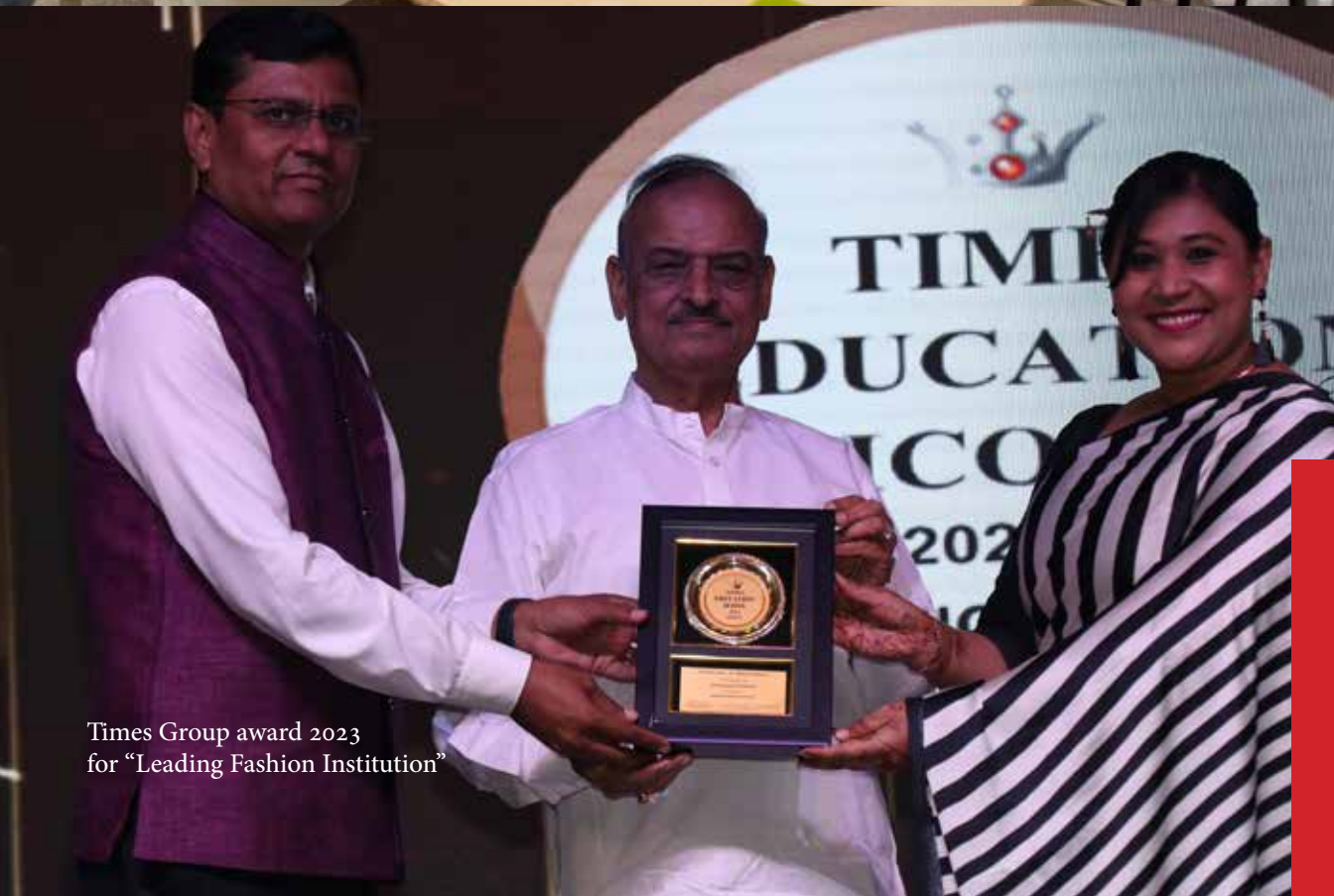
Times Group award 2023 for "Leading Fashion Institution"