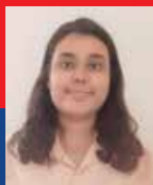
Floor & Furnishings