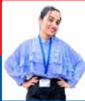
House of Torani