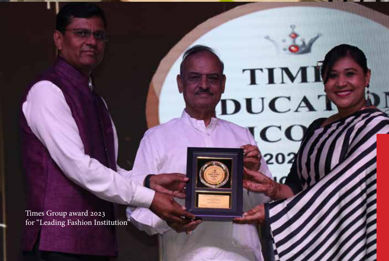
Times Group award 2023 for "Leading Fashion Institution"