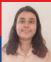
Floor & Furnishings