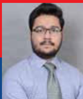
The Bim Engineers