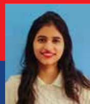
Studio Blue Hill