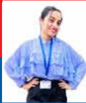
House of Torani